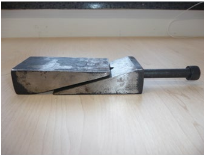
Figure A1 – Example of adjustable steel wedges