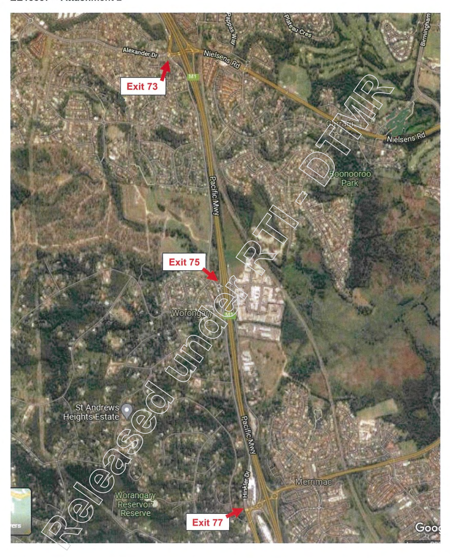
EE13387 - Attachment 2