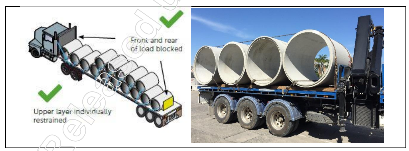
Figure 1: Transverse loading example

The Department of Transport and Main Roads (TMR) will retain the current loading conditions of a maximum width of 2.5m for all heavy vehicles with divisible loads in Queensland, whilst preserving the ability for industry to apply for a permit where the transport task is related to a coordinated project. This will allow TMR to assess each application on its merits and ensure risks are appropriately managed.