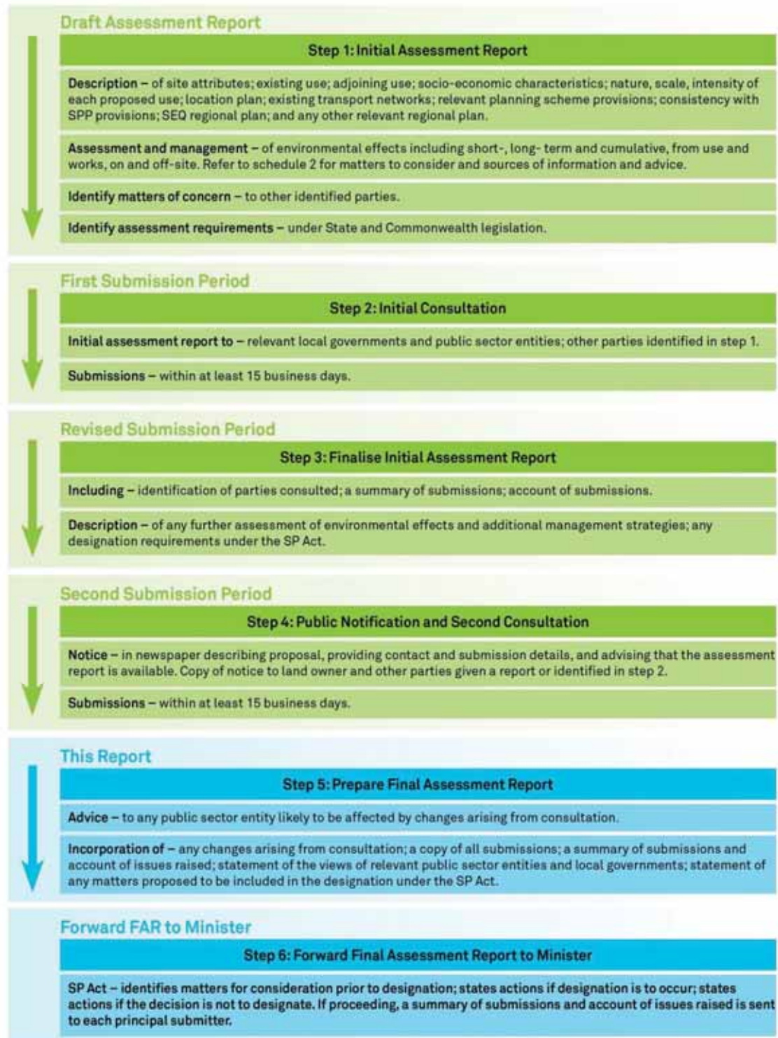
Figure 2: The community infrastructure designation process, and its application to the SFRC study