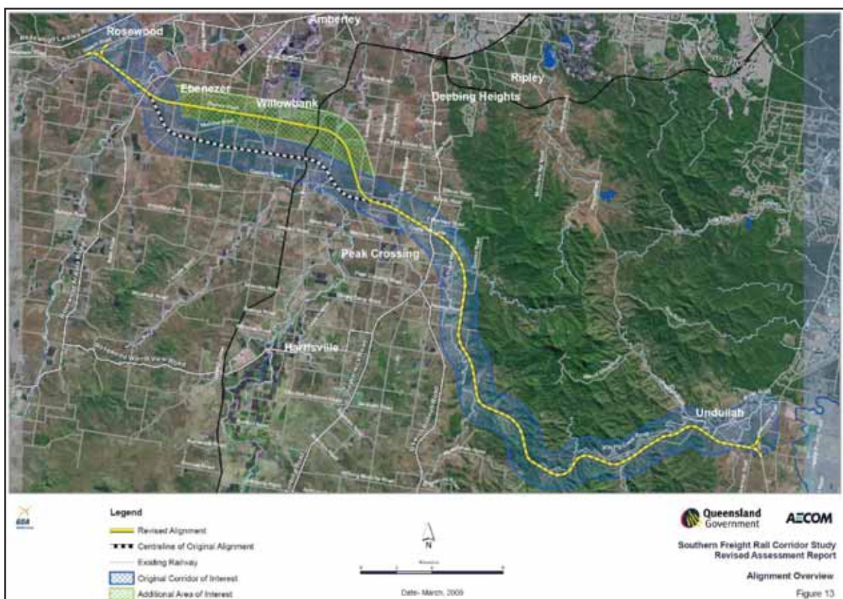
Figure 1: The SFRC alignment (in yellow) and the corridor of interest which formed the specific study area for the SFRC

In mid 2007, the Department of Transport and Main Roads (TMR), (formerly Queensland Transport (QT)) initiated the Southern Freight Rail Corridor (SFRC) Study . This planning study seeks to identify a preferred rail connection between the existing narrow gauge Western Rail Line near Rosewood and the existing interstate standard gauge rail corridor (SGR) near Kagaru, such that the corridor can be reserved for future construction and operation of a railway line (construction is not expected to be prior to 2031). Investigations to provide this connection have generally been undertaken within a 55km-long and 2km-wide corridor of interest which was developed from previous preliminary studies undertaken in 2005. Due to constraints in some areas, these investigations have extended slightly beyond the original corridor of interest, most notably in Ebenezer and at the eastern end of the corridor near Kagaru.