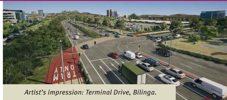
Artist's impression: Terminal Drive, Bilinga.

Gold Coast Light Rail Stage 4 will deliver a 13 kilometre extension south of Light Rail Stage 3, linking Burleigh Heads to Coolangatta, via the Gold Coast Airport. It will provide 14 stations as identified through the Burleigh Heads to Tugun and Tugun to Coolangatta Multi-modal Corridor Studies.