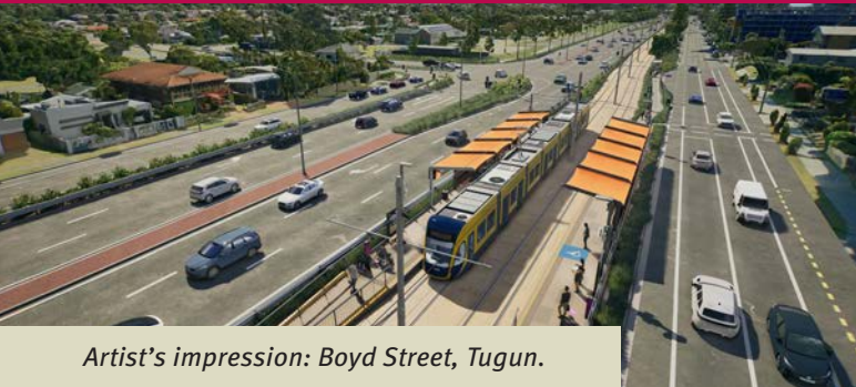
Artist's impression: Boyd Street, Tugun.